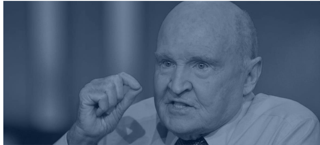
JACK WELCH, Legendary CEO

“Anybody can manage short. Anybody can manage long. Balancing those two things is what management is.”