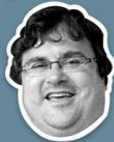
REID HOFFMAN FOUNDER, LINKEDIN

If you are not embarrassed by the first version of your product, you've launched too late.